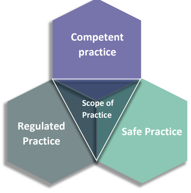
Diagram 1: Scope of Practice for Registered Counsellors

Consideration should be given to each facet for a complete view of counsellors' professional